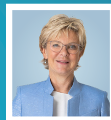
MARTINE HANSEN Minister of Agriculture, Food and Viticulture & for Consumer Protection