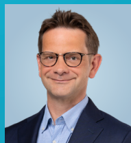
ZEIMET LAURENT 50, Bettembourg, Lawyer, Mayor Southern District