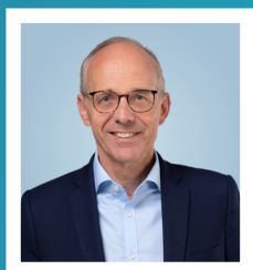
LUC FRIEDEN Prime Minister