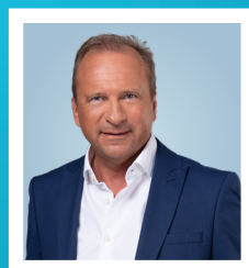
GILLES ROTH Minister of Finance