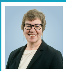
MARTINE DEPREZ Minister of Health and Social Security