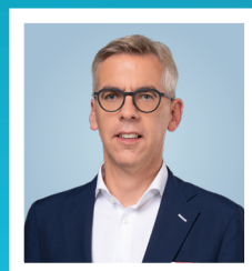
LÉON GLODEN Minister for Home Affairs