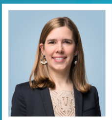
ELISABETH MARGUE Minister of Justice Minister Delegate to the Prime Minister for Media and Connectivity & for Relations with Parliament